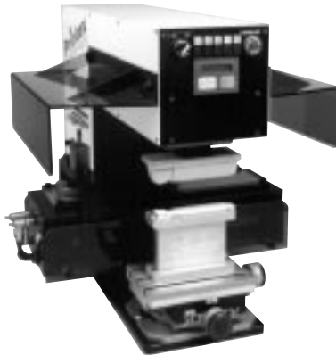
One Color Transverse Cup

Designed to print flat or three-dimensional objects (of either smooth, rough or textured surfaces) with from one to four colors.